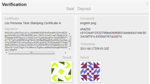
Figure 1 – Involving the user in digital signature checking translating technical elements (Lex4Lab screenshots [5])

Because computations are too complex to be replayed by hand by the user, we let the user do only the last operation: an equality test on two very large numbers (hashes). By representing those two numbers by generated icons, the comparison can be done by the user's preattentive perception (i.e. "in the glimpse of an eye").