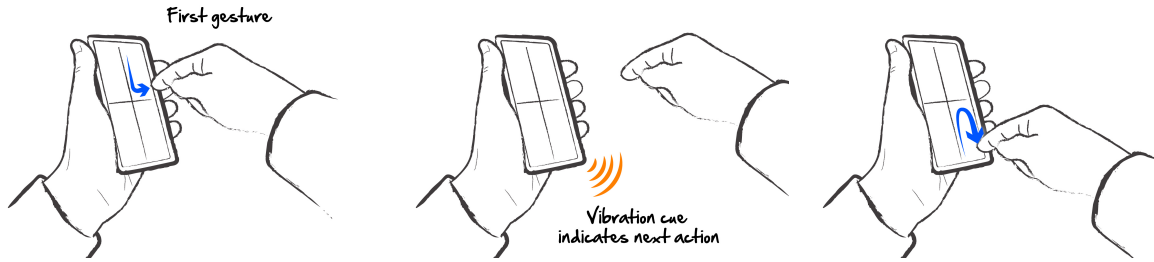
Figure 2: Example of first three steps when entering H4Plock. The user is presented with a vibration cue after entering a gesture, to indicate whether the following gesture to be entered should be selected from the primary or secondary passcode. This process will continue until up to a total of four gestures have been entered.

Participants were asked to replicate the observed entry to the system, similar to studies [3, 1].