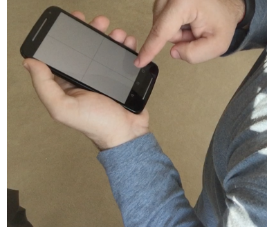
Figure 1: Screenshot of H4Plock as used in the videos for security testing session

The research progress described herein addresses three areas: (1) the feasibility of using both gestural and tactile cues for purposes of authentication; (2) the viability of remembering these cues after periods without using the system; (3) assessing the susceptibility of the solution to video-based attacks.